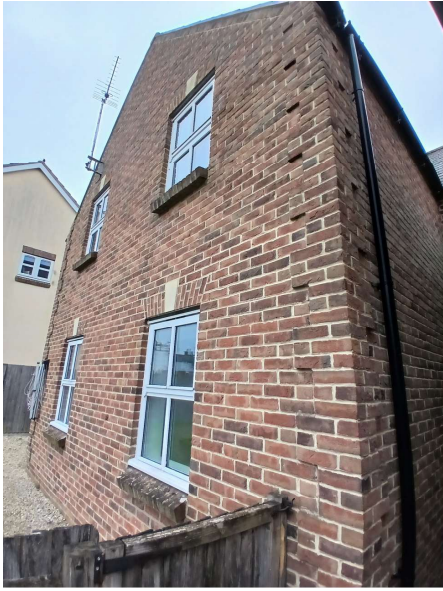
Exterior Structure (The Building)