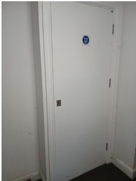
Cupboard Doors (Electrical Cupboard Doors)