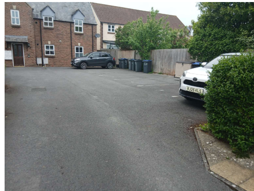
Car Park (Vehicle Parking)