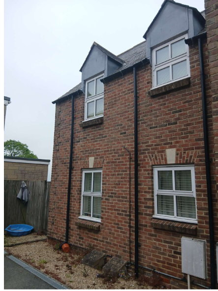
Guttering (Gutters and Fascia)