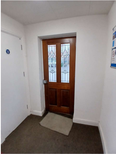
Entrances (Main Doors)