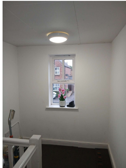
Windows (Communal Windows)