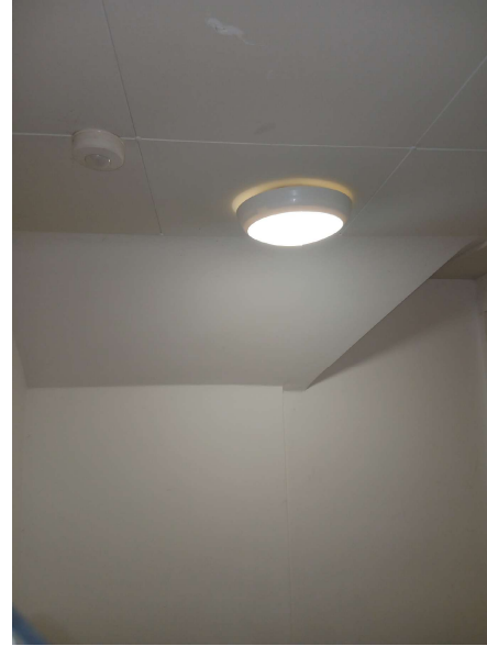
Lighting (Standard and Emergency Lights)