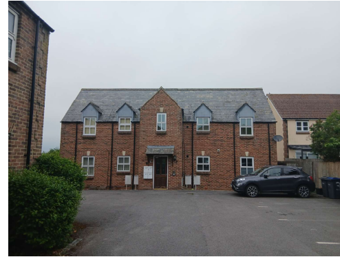
Roofing (Tiles and Cladding)