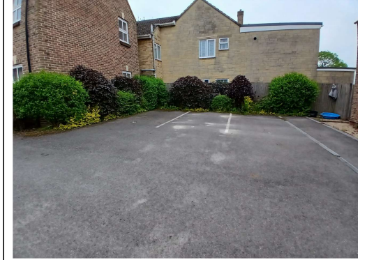
Communal Grounds (Gardens and Common Areas)